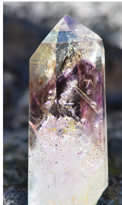
Look inside this Brandenburg crystal for a tube containing an air bubble, this is where the water is held within the crystal.

The first crystal that stepped forward proved to be a powerful contributor to all three paintings. A Brandenburg Crystal from Namibia combines the energetic resonance of Amethyst, Clear and Smoky Quartz, while holding, within its structure, minute amounts of pristine water from the time of its formation within the earth, maybe 2 million years ago. These Brandenburg crystals help to align the entire Chakra system and are powerful tools for cellular healing -- the perfect ally to help anchor the center of each painting.