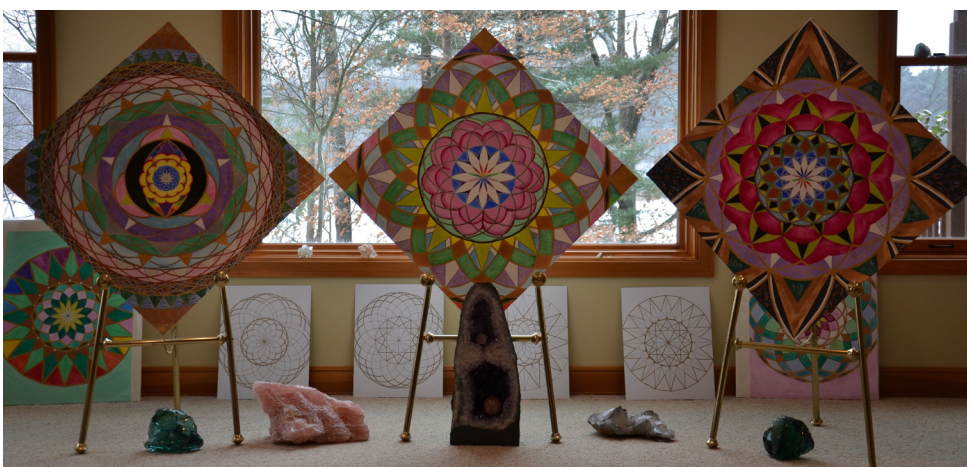
Earth Star Chakra