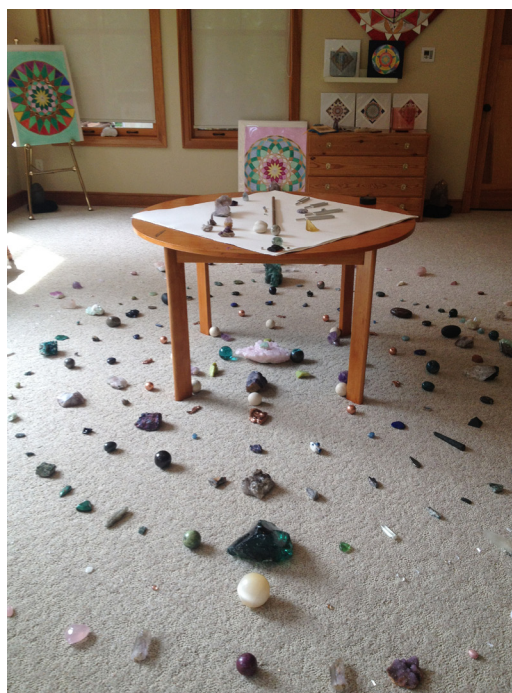
The Fibonacci Crystal Grid on the floor of the studio - Concentric circles of crystals following the numbers of the Fibonacci Sequence, with the outer circle containing 144 crystals.

The drawings themselves were started following an inspirational trip to the Island of Iona and Rosslyn Chapel in Scotland. Iona is a place of cleansing, renewal and rejuvenation where we raise our personal frequency simply by being present and allowing the shift to take place - an important step in my preparation for painting. At Rosslyn Chapel I collected the final piece of the puzzle when my attention was captured by a stone carving of a five petal rose. I knew immediately that roses were to be interwoven with the geometry as a central theme for each painting.